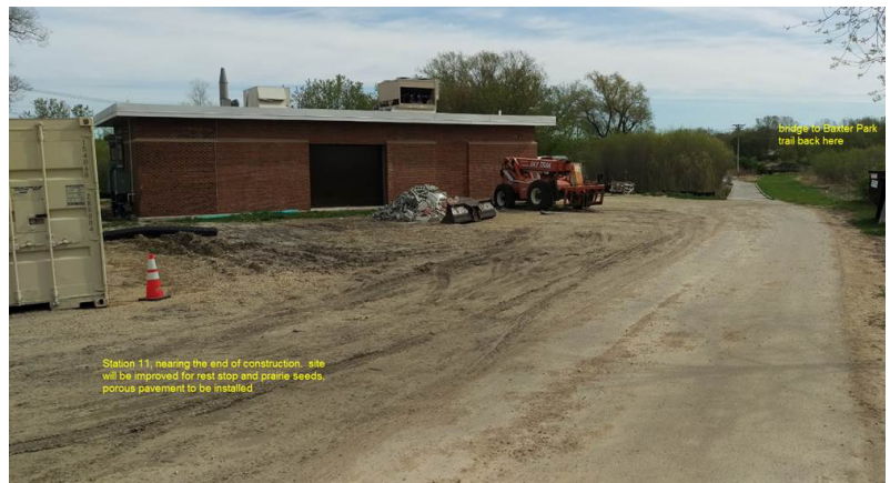
Station 11, nearing the end of construction. The site will be improved for a rest stop, porous pavement, and prairie seeding.