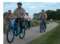
Capital City State Trail (left) is featured on National Trails Day, June 4 th . Stop by our water station and take a guided bird walk or springs tour!

Speakers will share inspiring information on the health benefits of parks and trails. Proceeds will support the Friends of Dane County Parks Endowment, a permanent, charitable fund designed to provide educational opportunities and sustaining support for 4000+ volunteers and Park Friends groups, and protect our most precious natural resources. More details to come – visit our web site.