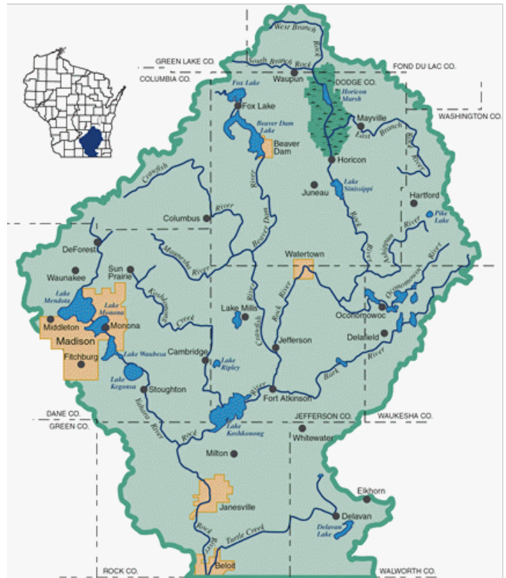
The Rock River Basin includes a large portion of south-central Wisconsin, including the Madison chain of lakes.

We now have over 50 sampling sites throughout the Yahara River Watershed and three sites are in the Capital Springs Recreation Area: Penitto Creek by the Dutch Mill Park and Ride, just before it discharges into Upper Mud Lake; Nine Springs Creek by the Jenni & Kyle Preserve; and Nine