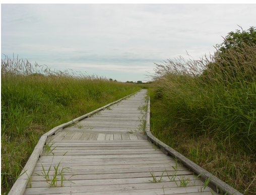
Madison Metropolitan Sewerage District Boardwalks lead to wetland ponds at CSRA.

Have you noticed that there is an increased energy from folks in the region related to water quality improvements? The Yahara Watershed Improvement Network (WINs) is now employing the Watershed Adaptive Management plan this year. On April 15 th , the Inter-Governmental Agreement went into effect, which means that trial processes for improving nutrient problems in local waterways via adaptive management are going full-scale throughout the entire Yahara River basin. Many entities play vital stakes in this program - please refer to the web site for details: http://www.madsewer.org/Programs-Initiatives/Yahara-WINs .