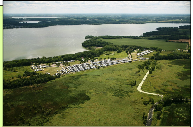
This photo depicts the almost 400 motor coaches that stayed at Lake Farm Park for the Family Motor Coaches Association (FMCA) convention in July at Capital Springs.