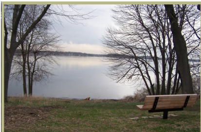
Capital Springs protects more than three-quarters of a mile of undeveloped Lake Waubesa shoreline.

The Capital Springs Recreation Area just south of Madison encompasses about 2,500 acres stretching from Fish Hatchery Road east to Lake Waubesa, including most of the Nine Springs E-way. There are many different areas of the park to explore, including the Lake Farm Park, the Jenni & Kyle Preserve, and Capital City State Trail which meanders through the park, connecting to other area bike trails and downtown Madison. Stop by the Lussier Family Heritage Center for additional information and a map.