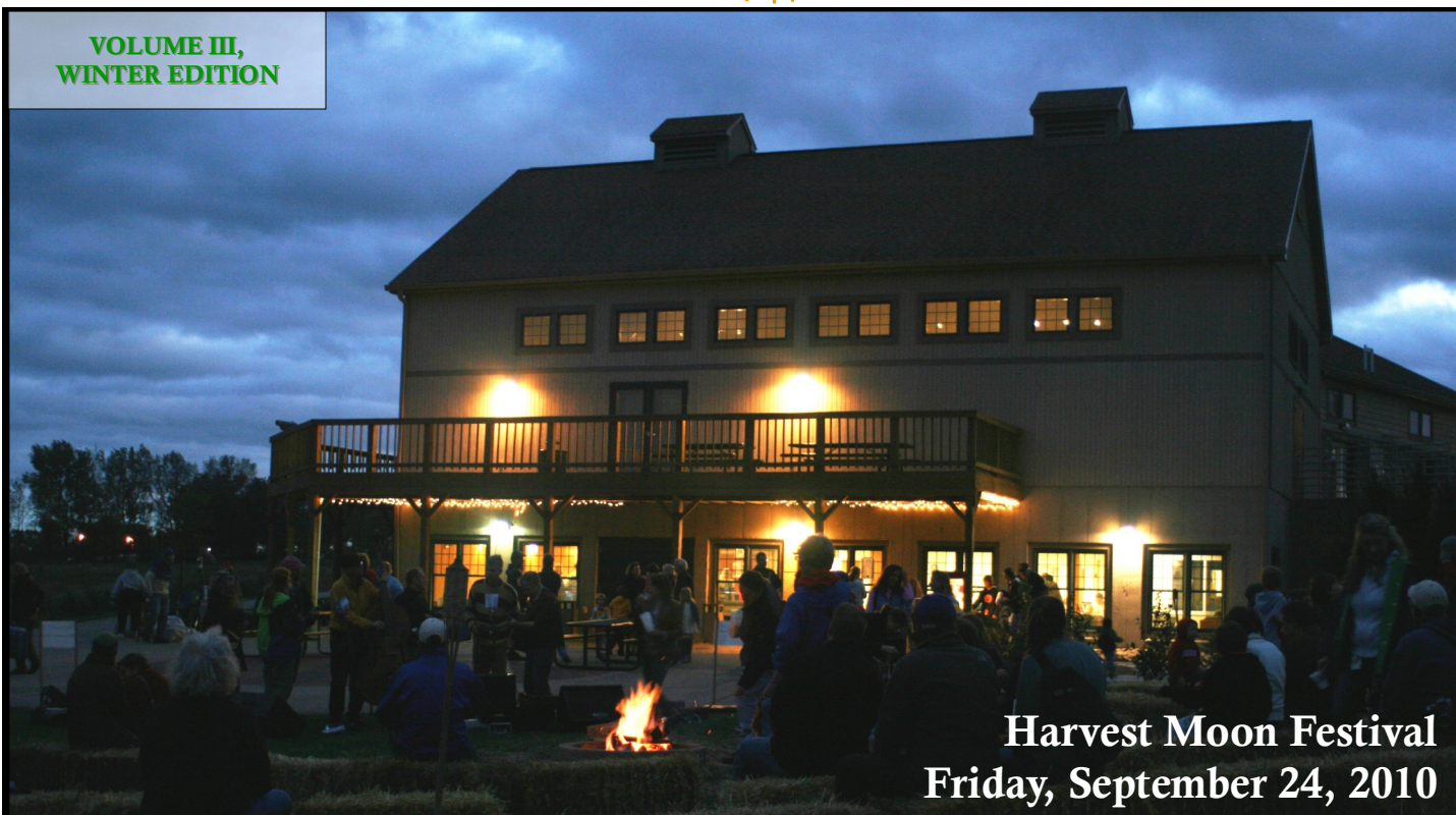
Harvest Moon Festival Friday, September 24, 2010