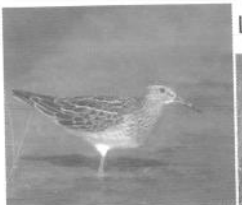
Left: Pectoral sandpiper