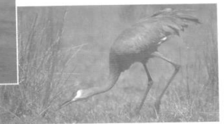
Right: Sandhill crane