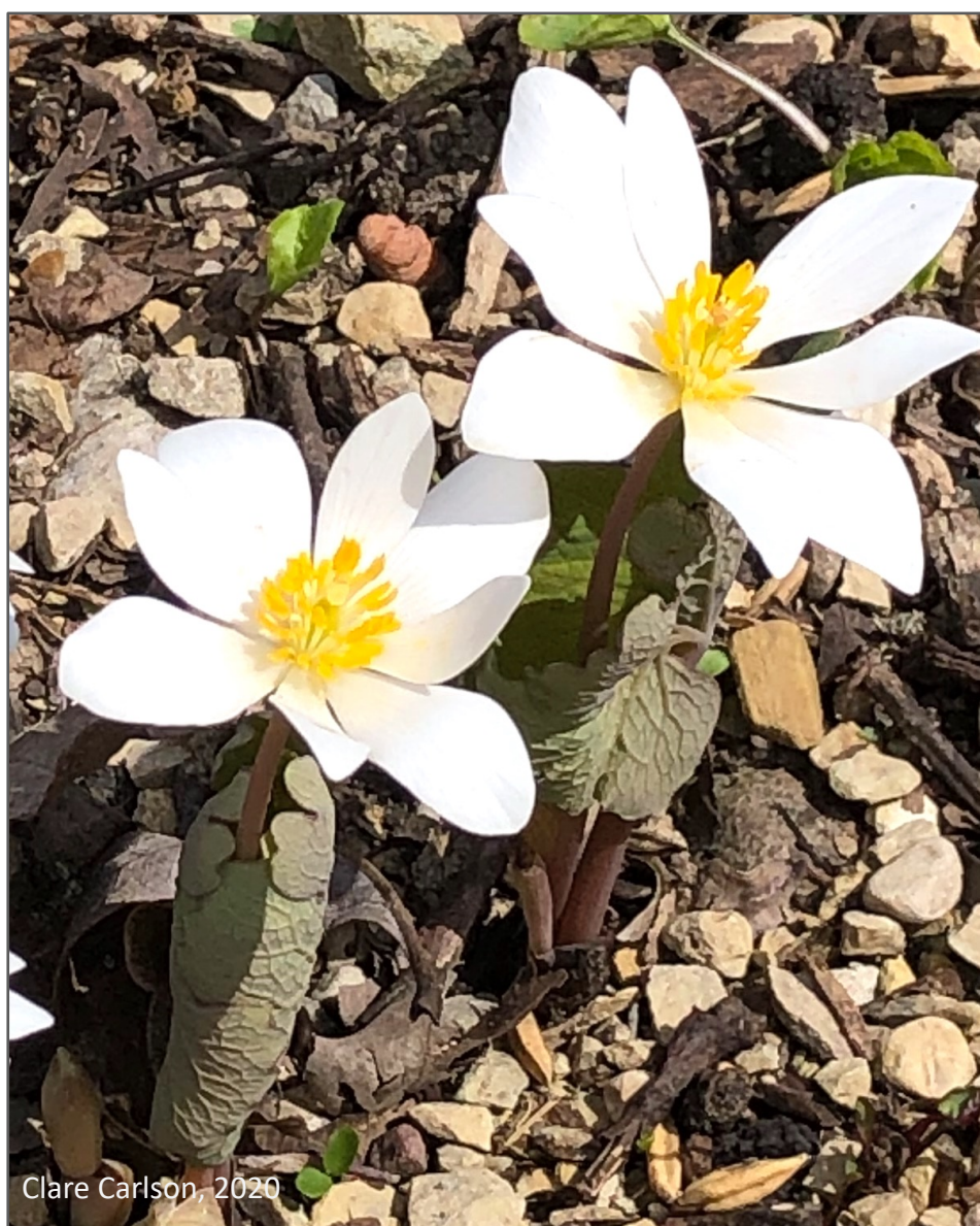
Clare Carlson, 2020

Bloodroot is used for making a pink or red dye.